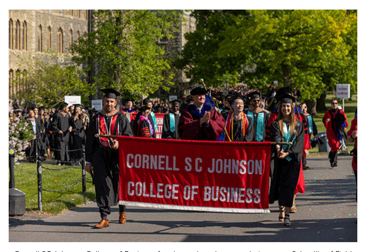
Cornell SC Johnson College of Business faculty and students on their way to Schoellkopf Field